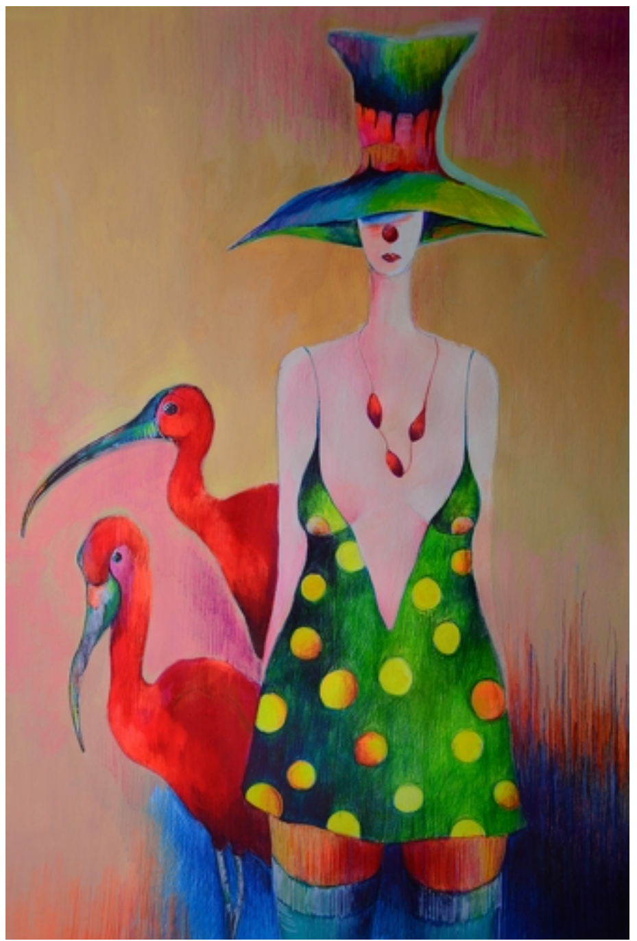
"Wera-Our aspirations are our possibilities" mixed media on paper, 30 x 40cm

I want to believe that my paintings convey the additional message that each person is special and unique. It is never too late to discover our hidden talents and be happy!