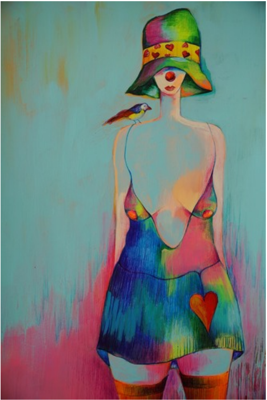
"Nylah-Hope is a passion for the possible" mixed media on paper, 30 \times 40 cm

Using different mediums such as acrylic paint, colored pens, and crayons allows me to express the stories I want to tell in the best possible way. If I'm being honest, my favorite tool is the pen, which is why most of my work is done on paper. What matters to me is the exact outline of my idea; after that, it's just playing with color.