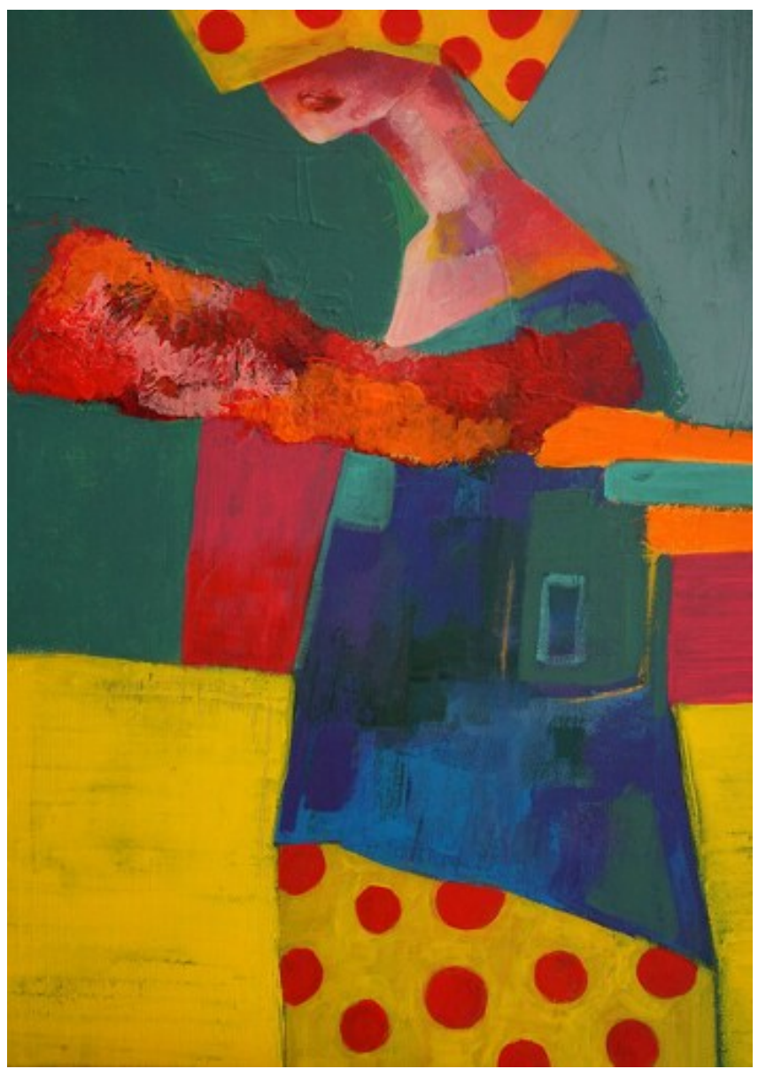
"Ada-If there is no way, make it and go" acrylic on canvas, 50 x 60cm

The decision to start school again had a huge impact on what happened later in my life. I started to paint my Woman's World as a therapy to overcome my own complexes and begin a path towards self-acceptance. Returning to my art passion allowed me to rediscover what gives me happiness and satisfaction and also understand that I don't have to follow the lifestyle imposed by media and meet society's expectations to feel happy and fulfilled.