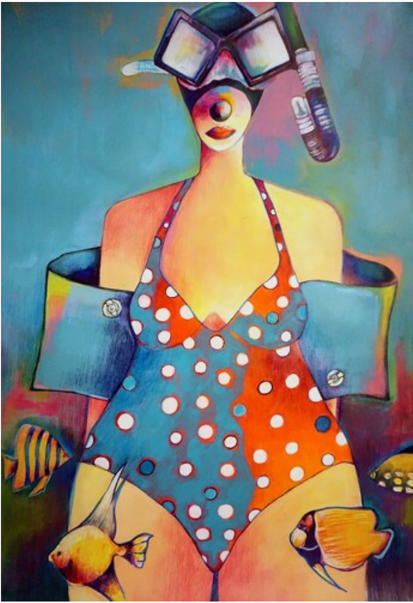
"Vaila-Don't limit yourself by own thoughts" mixed media on paper, 50 x 65cm

I remembered one of my earlier wishes that one day I would like to do post-graduate studies in Art Therapy. I was looking for a school that would allow me to combine my work with the studies. In 2018, I completed one and a half years of further education in Art Therapy in Konstanz, Germany.