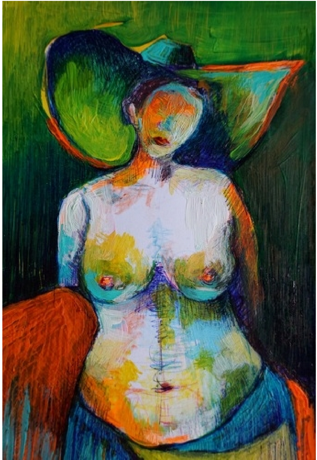
"Genesis-If you don't love yourself, nobody will" mixed media, 10 x 15cm