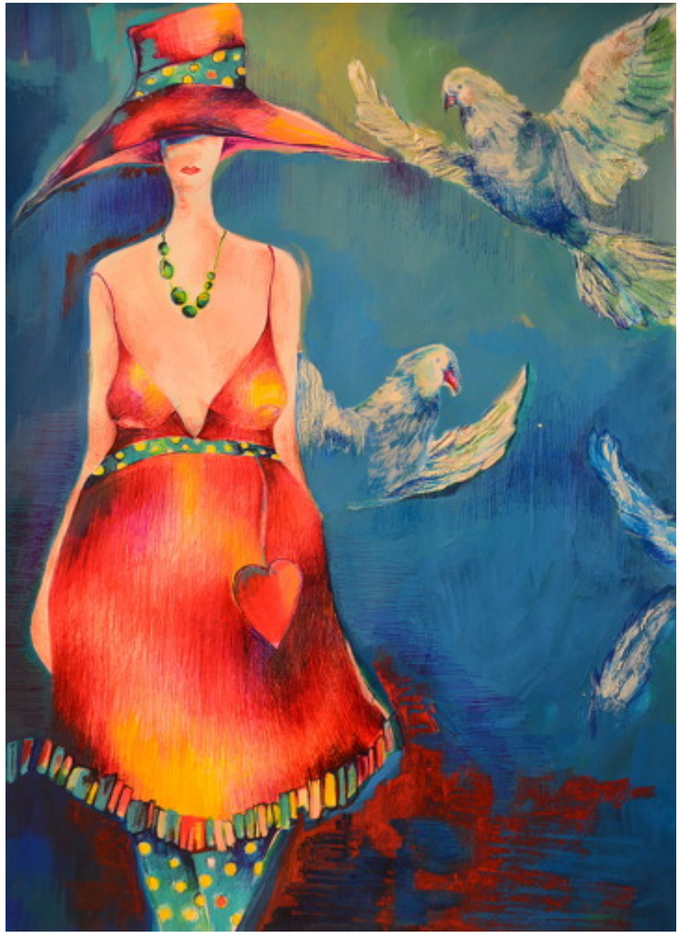
"Charlotte-Happiness is the present moment" mixed media on paper, 30 x 40cm

For several years I gave up art in favor of discovering my other skills and building a completely different career path. Several times I changed places of residence and work. At some point I asked myself, "Am I who I want to be? Do I feel fulfilled in what I do? Am I happy with myself?" The answer to each question was negative. I decided to find myself again.